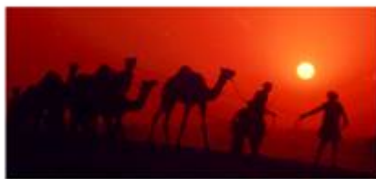
Sunset at Pushkar Fair

We have the entire day to enjoy and photograph the exciting Pushkar Fair.