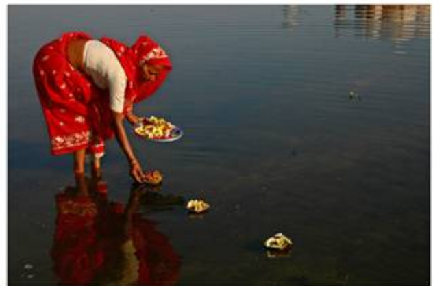
OFFERINGS FOR THE TAJ